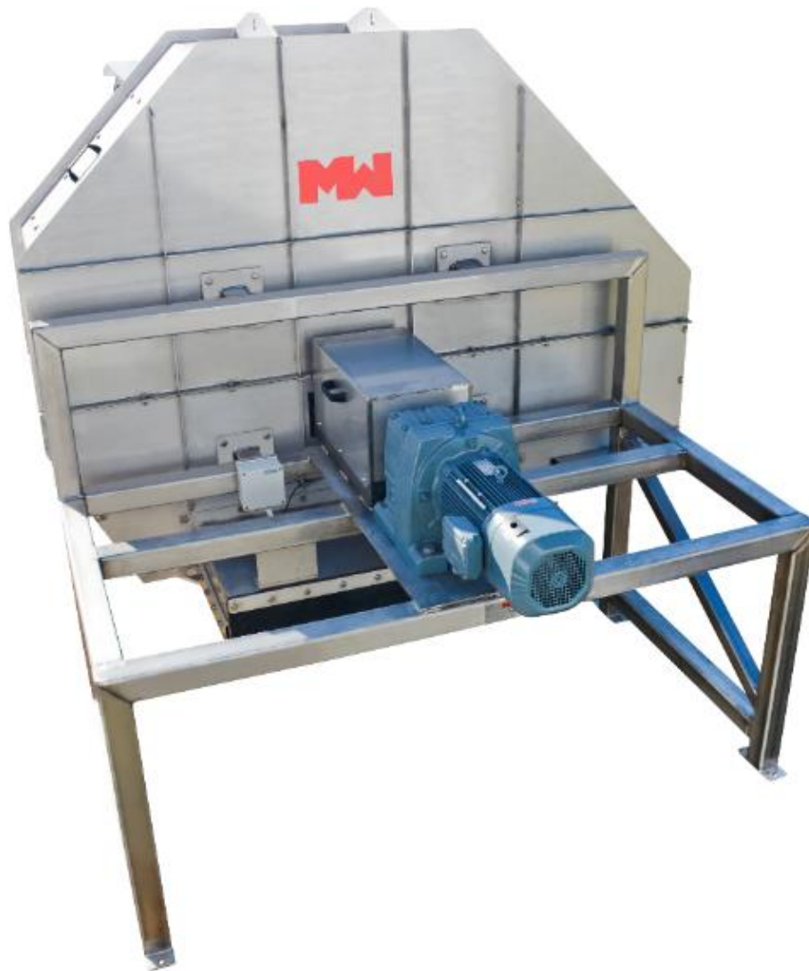
Cross-Belt Sampler (CBS)